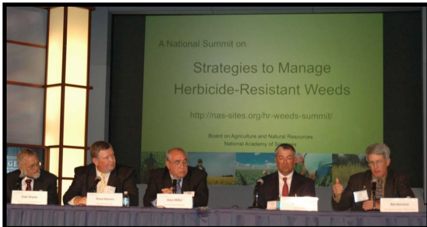
Experts discuss resistance management strategies

The morning session focused on establishing the severity of the herbicide resistance problem, and understanding the biological basis for development of resistance. In addition, the best management practices (BMPs) and recommendations from the WSSA report were delineated. This set the stage for the afternoon sessions, which explored the impediments to implementation of these BMPs, and the approaches that were most likely to overcome resistance development. The afternoon sessions had exceptional panels that fostered a great deal of discussion from the audience.