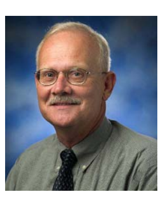
Tim R. Murphy Distinguished Service (Academia)