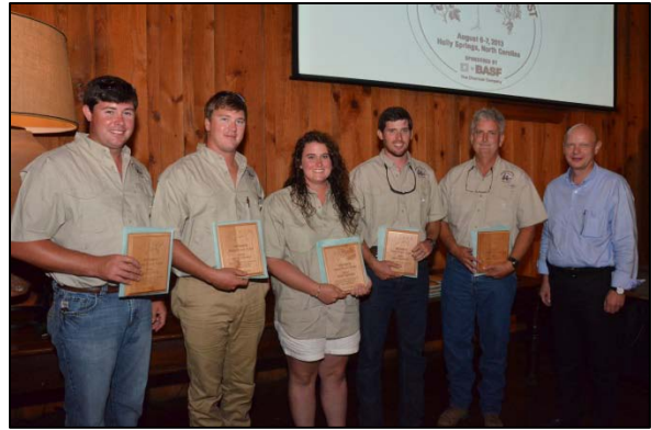
[Empty box for caption]