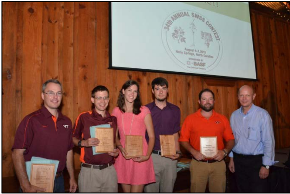
[Empty box for caption]