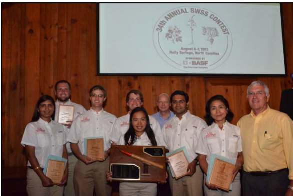
At left members of the University of AR First Place team

Winning individuals and teams were recognized at the awards banquet and plaques were presented to each winner. The traveling “Broken Hoe” trophy was presented to the University of Arkansas for their display throughout the next year. Monetary awards associated with each event will be mailed to the team coaches.