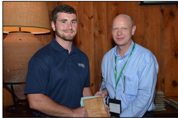
[Empty box for caption]