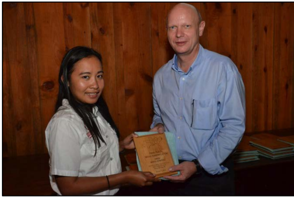
[Empty box for caption]