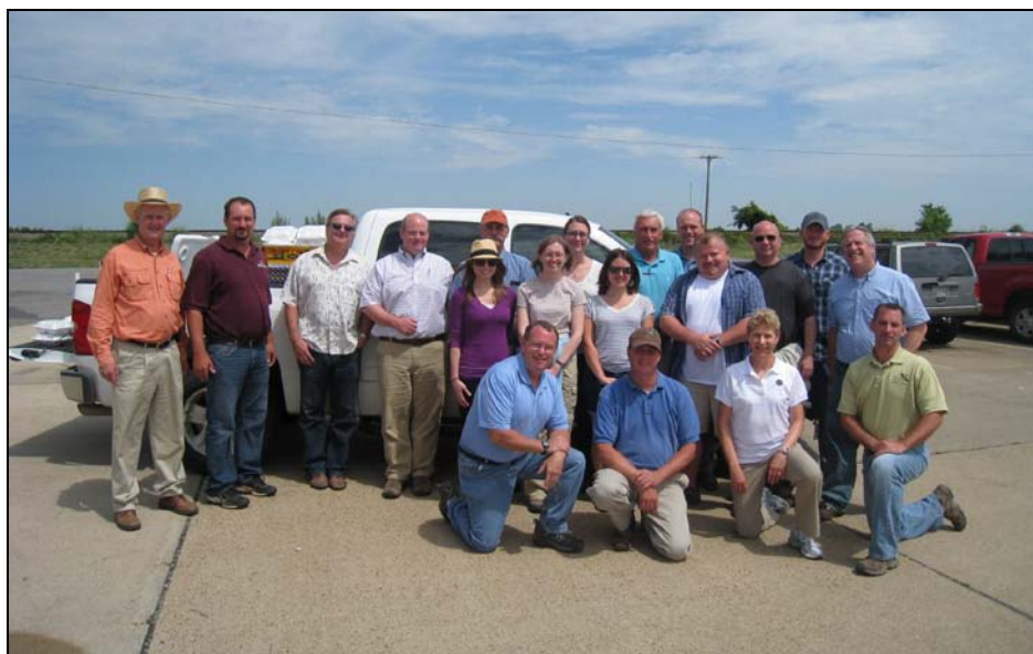
Participants of the 2011 WSSA Herbicide Resistant Weed tour as they stopped in Arkansas.

The tour provided a first-hand look at the scope, impact, and unique challenges that growers faced when trying to manage herbicide resistant weeds. We saw which best management practices were being used and why. We also saw how the complexity and economics of crop production sometimes prevented or limited other best management practices from being implemented. I think everyone on this tour gained a greater understanding of the realities of battling glyphosate-resistant weeds. It will take a herculean effort from all stakeholders to implement technologies and practices that will thwart the continued escalation of this problem.