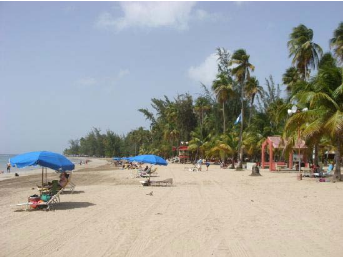
Wednesday, January 26 rd